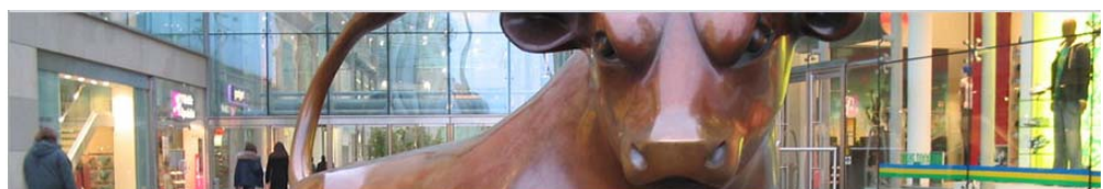
Rotaract Preconvention Meeting 2009 - Birmingham, UK

www.rotary.org/en/AboutUs/RotaryLeadership/RIPresident/Pages/Youth.aspx